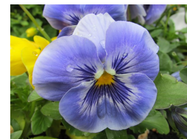
February Birth Flower Violet