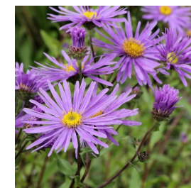
September Birth Flower Aster